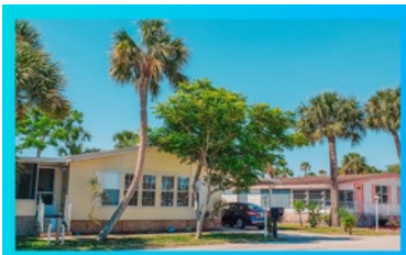
Florida MHC 4★ 175+/- Sites $19,000,000