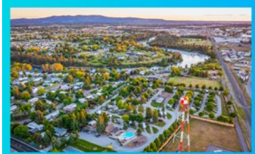
Washington RV Resort 3.5★ 125+/- Sites $8,300,000