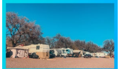
Arizona Hybrid Park 2.5★ 50+/- Sites $1,700,000