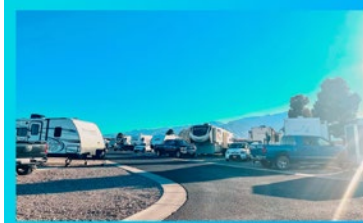
Arizona RV Resort 4★ 100+/- Sites $3,850,000