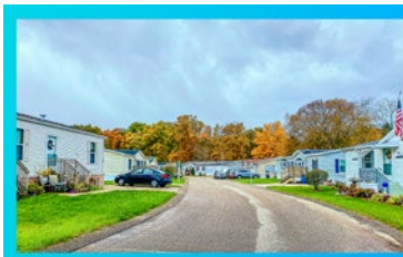
Michigan MHC 3★ 175+/- Sites $10,400,000