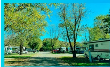
Kentucky Hybrid Park 3★ 150+/- Sites $4,600,000