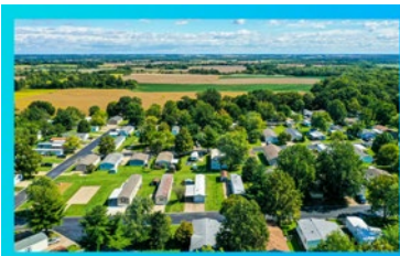
Illinois MHC 3.5★ 250+/- Sites $17,550,000